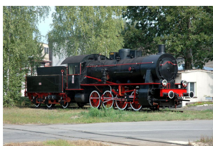
die erhaltene Tp4-217, eine ehemalige G 8.1, in Pyskowice