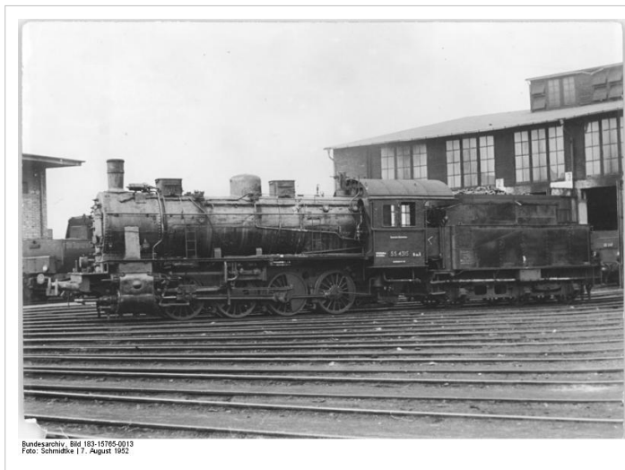
55 4315 am 7. August 1952

G 8.1 (Preußen, Mecklenburg, Elsaß-Lothringen) DR-Baureihe 55.25–56, 55.58 DB-Baureihe 055 PKP Tp4 ČSD-Baureihe 425.0 LG P8 SJ G