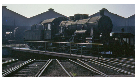
SNCF 040D, Calais 1968