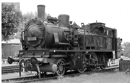
74 1192 im Eisenbahnmuseum Bochum-Dahlhausen 2004

Obwohl die Baureihe bereits seit dem Jahre 1902 in vier Versuchsexemplaren (mit Rauchkammer- anstelle des späteren Rauchrohrüberhitzers) und damit noch vor der T 11 zur Verfügung stand, begann die Serienproduktion erst im Jahr 1905. Neben der Preußischen Staatsbahn erwarben unter anderem auch die Reichseisenbahnen in Elsaß-Lothringen (25 Stück), die Lübeck-Büchener Eisenbahn und die Halberstadt-Blankenburger Eisenbahn Lokomotiven dieses Typs.