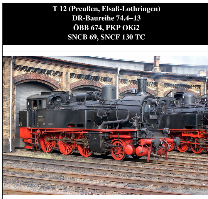
74 1230 Bw Berlin-Schöneeweide 12. September 2010